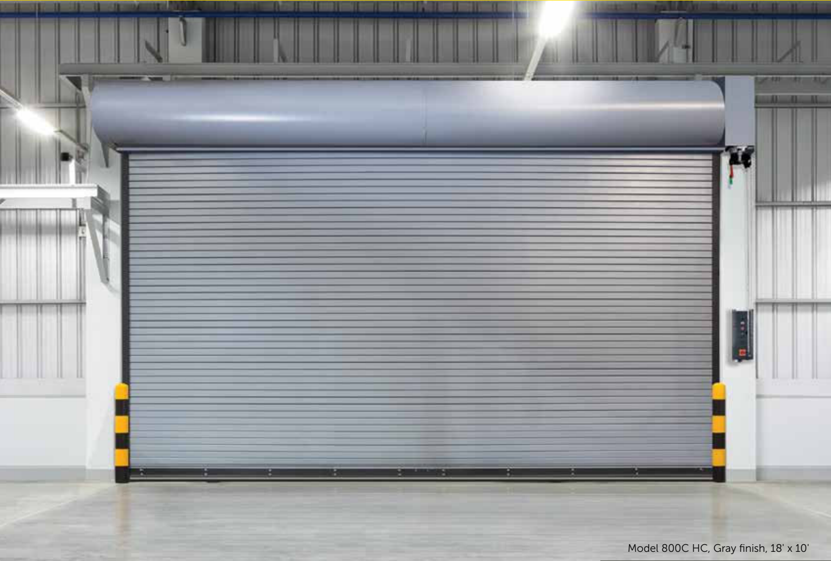
Model 800C HC, Gray finish, 18' x 10'