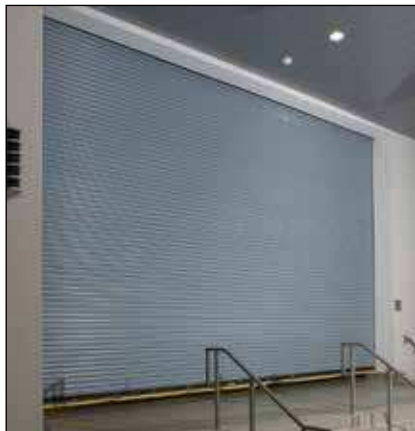
No. 4 slat

Secur-Vent® — Perforated slat provides optimal security and ventilation. Slat consists of 1/16" diameter holes offering 20-25% open area over length of each slat. Available in No. 14 flat slat up to 22' wide x 20' high (available in 20-gauge steel only).