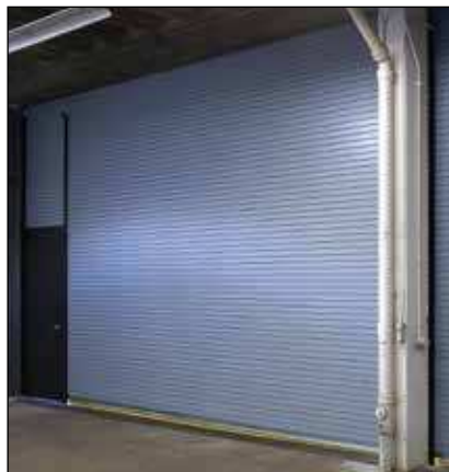
No. 14 slat, shown with a Pass Door